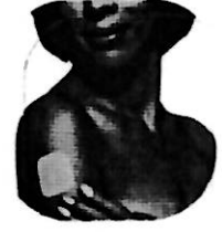
Upper Outer Arm