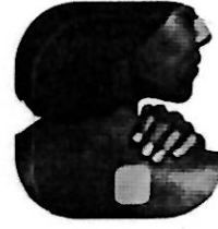
Upper Torso (excluding the breasts)